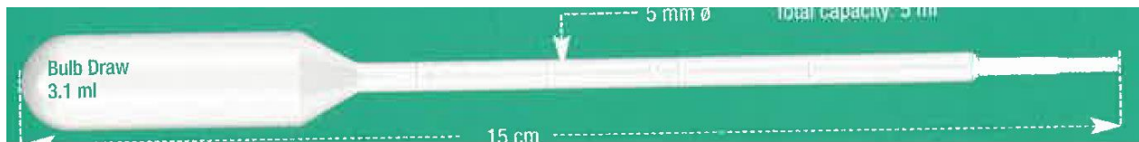
DLAQ400-5220S & MTCP4111-11/MTCP4111-14